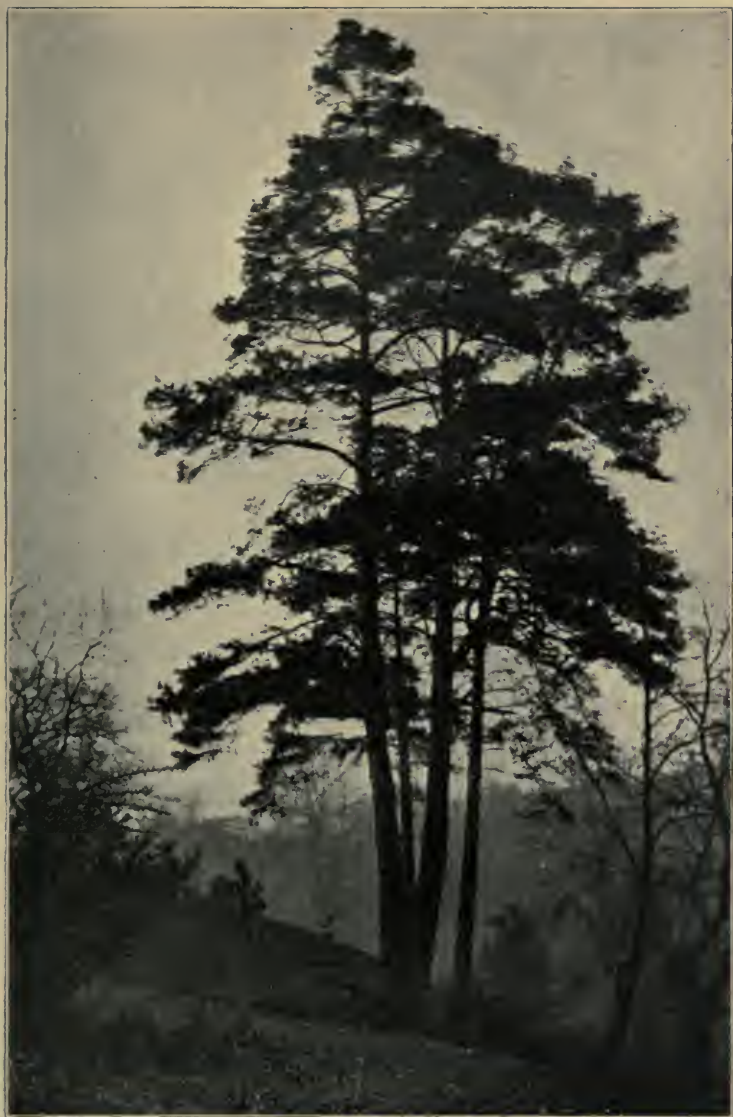
'STRUCK DEEP ITS ROOT, AND LIFTED HIGH ITS GREEN BOUGHS'